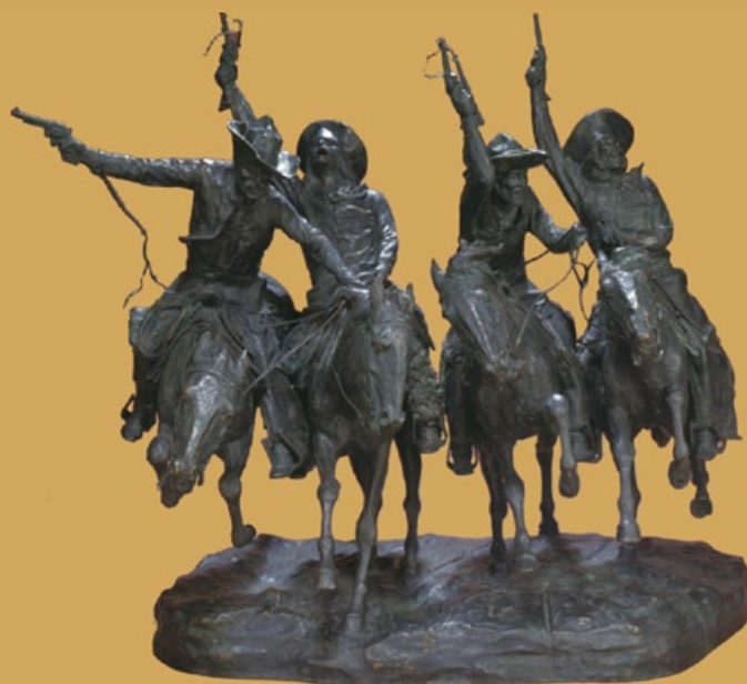
▶ Frederic Remington (1861-1909) Coming Through the Rye , 1902 Bronze 27 \frac{1}{4} x 30 \frac{5}{8} x 27 \frac{3}{8} inches 21.2.4