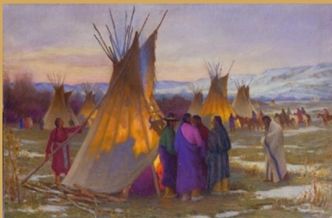
▲ Joseph Henry Sharp (1859-1953) Council Call of Crows, Montana , 1898 Oil on canvas 20 \frac{1}{8} x 30 \frac{1}{4} inches 31.25.35